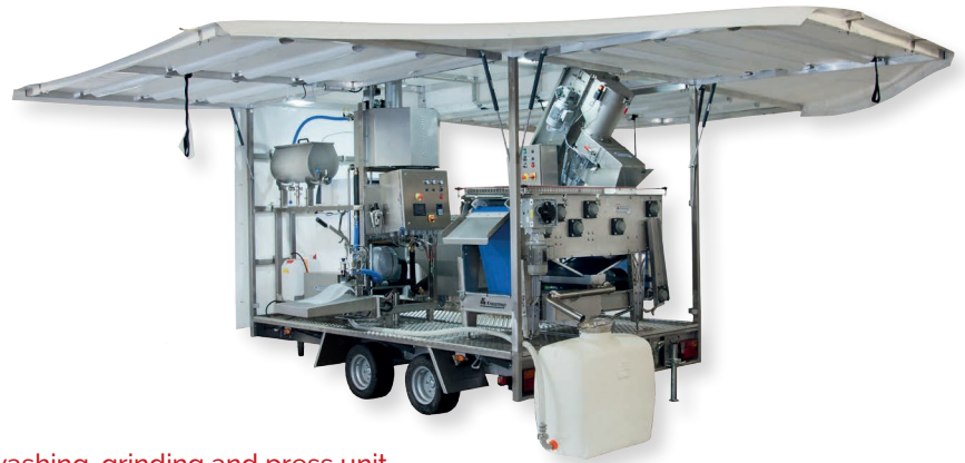
Mobile washing, grinding and press unit

Due to the special construction of the filling valve, you can achieve a high filling accuracy and avoid delay yield.